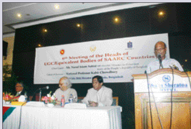
Education Minister Mr. Nurul Islam Nahid, MP speaking at the inaugural ceremony of the 6 th Meeting of the Committee of the Heads of UGC/Equivalent Bodies of the SAARC Member Countries

The 6 th meeting recommended publishing a 'SAARC Regional Handbook on Chartered Universities/Degree