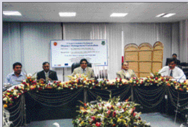
Food & Disaster Management Minister Dr. Muhammad Abdur Razzaque, MP and other distinguished guests at the Expert Consultation Workshop at Bangladesh University of Professionals

The 5 th Expert Consultation Workshop on Disaster Management Curriculum Jointly organized by (BAU) & CDMP was held on 31 July 2010 at BUP, Mirpur Cantonment.