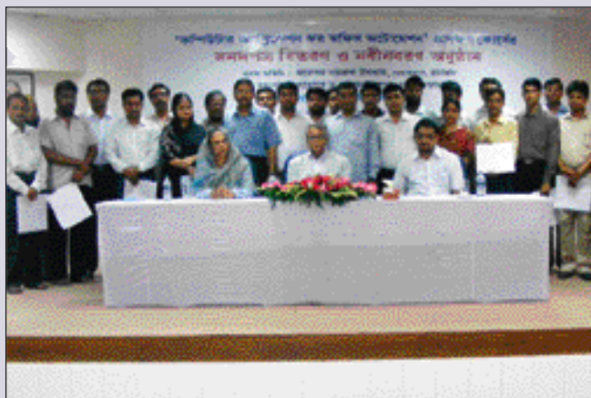
The computer training certificate recipient officers and employees of UGC with the UGC Chairman