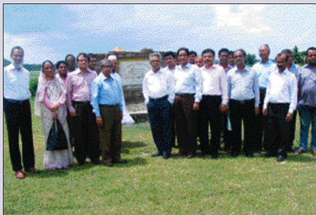
UGC Chairman along with the UGC Members at the site of Bangabandhu Sheikh Mujibur Rahman Science & Technology University, Gopalganj