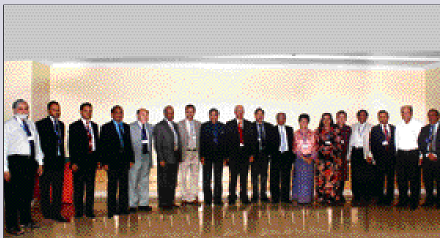
Participants of the 6 th Meeting of the Committee of the Heads of UGC/Equivalent Bodies of the SAARC Member Countries