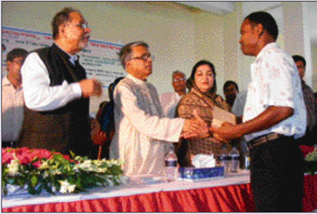
UGC Chairman along with Jute and Textile Minister Mr. Abdul Latif Siddiquee handing over incentives to the best result making educational institutions of Kalihati Upazilla