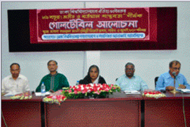
Agriculture Minister Begum Matia Chowdhury, MP along with DU VC & Pro VC at the roundtable discussion of DUMCJAA

Speaking at the function, Matia Chowdhury called upon all concerned of the university including teachers and students to play more effective role in maintaining congenial atmosphere on the campus.