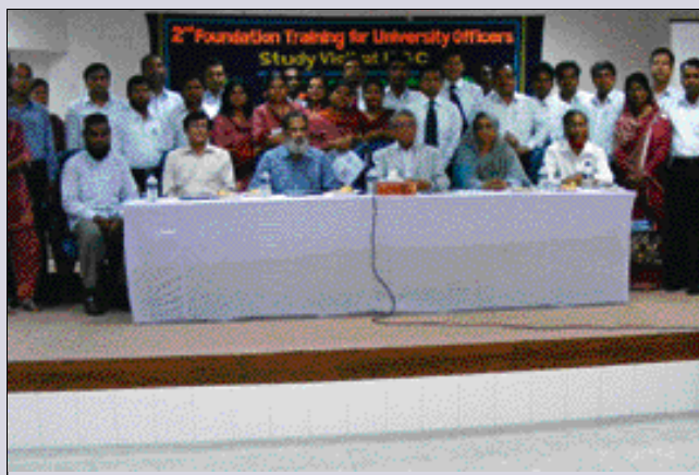
GTI trainee university officers with the UGC Authority during their study visit at UGC

At the meeting, the trainees thanked UGC for funding GTI to implement such a training programme for them. They also urged UGC Chairman to expand it. UGC Chairman assured them that UGC realizes the need of training