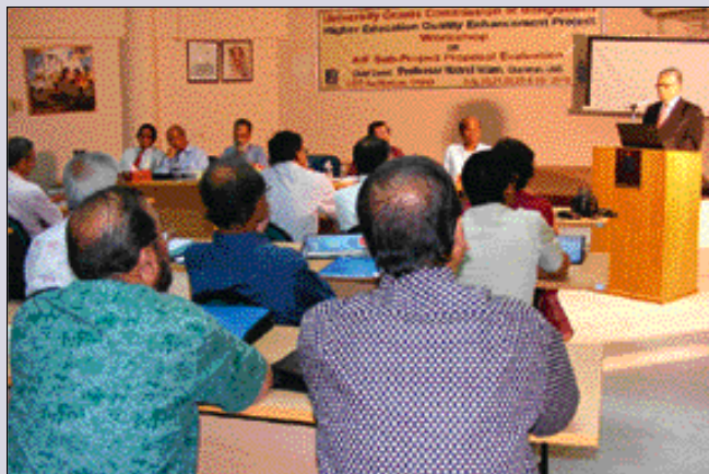
UGC Chairman addressing the inaugural session of AIF Sub-Project Proposal Evaluation Workshop of HEQEPat UGC

A five-day long workshop on AIF Sub-Project Proposal Evaluation was held during 20-22 and 25-26 July 2010.