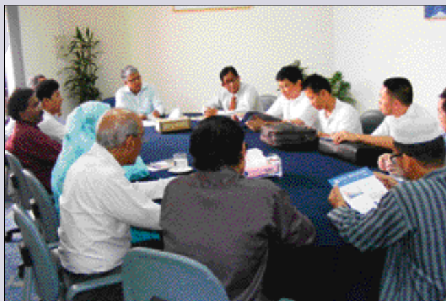
The delegation of Hunan Company and Hunan University of China exchanging views with the UGC Authority