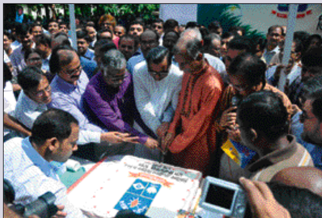
Mr. Rashed Khan Menon, MP, Chairperson of the Parliamentary Standing Committee on Education Ministry, along with DU Authority cutting a cake on the occasion of 89th founding anniversary of DU

The University of Dhaka celebrated its 89 th founding anniversary on July 01, 2010 at its own campus. Dhaka University started its journey on this day in 1921. Since then, teachers and students of the university have been a beacon of hope for the nation. The theme of this year's celebration was "Higher education to build digital Bangladesh".