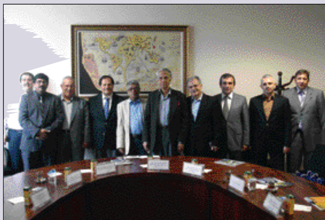
The Bangladesh team with the Rector, Deans and senior professors of Fatih University in Istanbul

Hospital, Head office of Zaman, a newspaper with largest circulation in Turkey, Samanyolu TV station, Fetih College, Kimse Yok Mu Solidarity and Aid Association, an international NGO in Turkey which provided relief and schools in Golachipa, Patuakhali after the devastating cyclone Sidr in 2007.