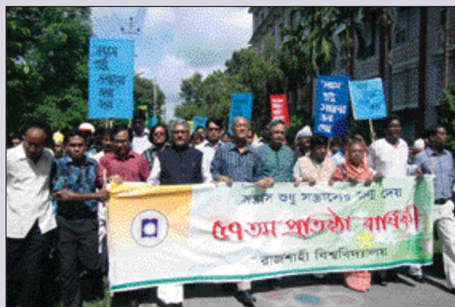
Education Minister Mr. Nurul Islam Nahid, MP along with State Minister of Home, Advocate Shamsul Haque Tuku, MP leading the procession of RU Anniversary Day