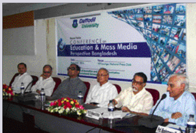
Mr. Rashed Khan Menon, MP, Chairperson of the Parliamentary Standing Committee on Education Ministry, along with other distinguished guests at the Roundtable Conference of DIU

A roundtable conference on 'Education and Mass Media: Perspective Bangladesh' was organized by the Department of Journalism & Mass Communication of Daffodil International University on August 01, 2010 at the VIP Lounge of Jatiya Press Club.