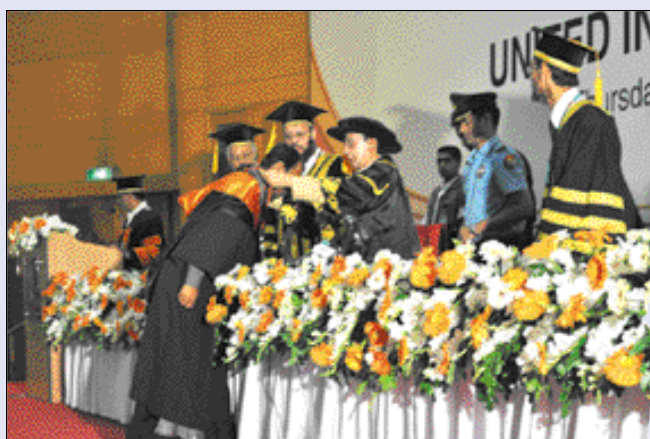
Hon'ble President Md. Zillur Rahman delivering Chancellor's Gold Medal to a Student at the 1 st Convocation of UIU

489 students from different disciplines were conferred undergraduate and graduate degrees while four