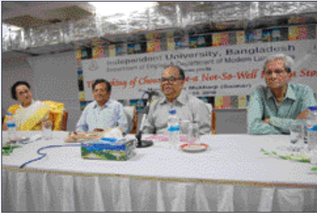
Renowned novelist Shankar is addressing at the Independent University, Bangladesh on October 20, 2010