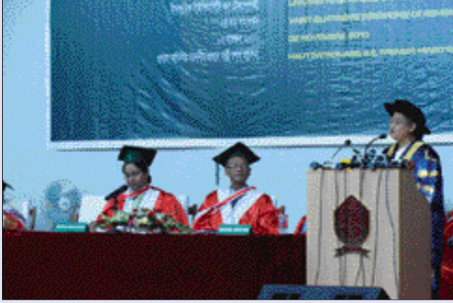
Hon'ble Prime Minister Sheikh Hasina addressing at the 24 th Convocation of Islamic University of Technology

The 24 th Convocation of Islamic University of Technology (IUT) at the end of Academic Year 2009-10, was held on November 02, 2010 in the University Campus at Board Bazar, Gazipur. Her Excellency Sheikh Hasina, Prime Minister of the Government of the People's Republic of Bangladesh graced the occasion as Chief Guest, while Dr. Dipu Moni M.P., Minister for Foreign Affairs, and Mr. Nurul Islam Nahid M.P., Minister for Education, were the Guests of Honour.