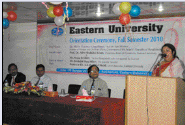
Dr. Shirin Sharmin Chowdhury, State Minister for Women and Children Affairs speaking at the Orientation Ceremony of Eastern University