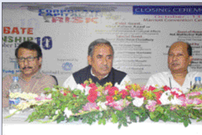
Information and Cultural Affairs Minister, GoB Mr. Abul Kalam Azad at the closing Ceremony of the 5th Stamford National Debate Championship

The closing ceremony of the 5 th Stamford National Debate Championship took place on October 13, 2010 at Marriott Convention Center, Dhanmondi. Minister of Information and Cultural Affairs, Govt. of the People's Republic of Bangladesh, Mr. Abul Kalam Azad was present at the ceremony as Chief Guest. In his speech, he said, "Debate inspires the practice of free thinking. Through the presentation of different subjects, it helps students become self-confident." He also praised the quality of teachers at Stamford and said that he gained a positive impression about private universities after the visit.