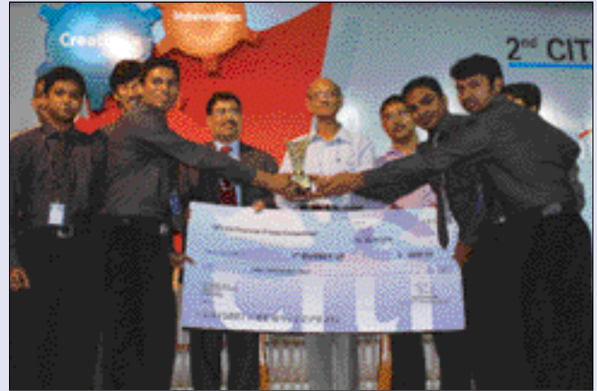
ULAB- Stride team receives a cheque and crest from the Education Minister Mr. Nurul Islam Nahid MP

ULAB-Stride, a programming team of University of Liberal Arts Bangladesh (ULAB), won the 1 st Runner Up in Citi Financial IT Case Competition (CFICC) 2010, beating 51 other teams, including teams from BUET, DU, NSU, IUB, EWU, BRAC University, AIUB, etc. The team's entry was 'An innovative, mobile phone-based DIP Micro-Banking Solution'. The winning team this year was from UIU.