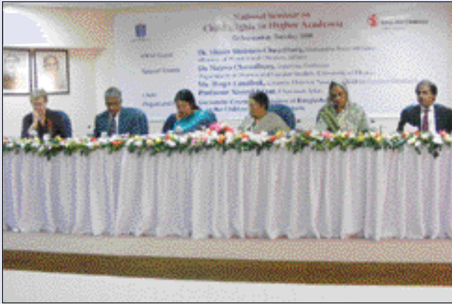
Women and Children Affairs State Minister Dr. Shirin Sharmin Chowdhury and other distinguished guests at the seminar on 'Child Rights in Higher Academia', held at UGC

She was speaking at a day-long national seminar on "Child rights in higher academia", jointly organised by University Grants Commission of Bangladesh (UGC) and Save the Children Sweden-Denmark (SCSD) at the UGC auditorium on November 23, 2010.