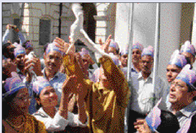
Festive mood of the 5 th founding anniversary day of Jagannath University

Vice-Chancellor, Treasurer, Deans, Teachers, university staff and several thousand students joined the procession wearing traditional dresses, cap and carrying banner and festoons.